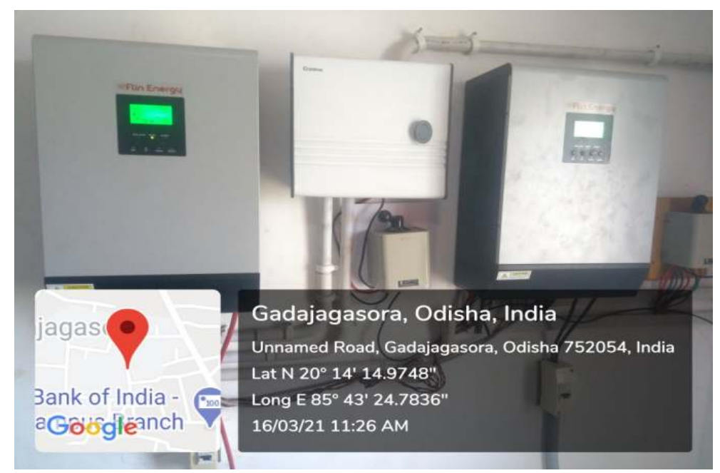
(Solar Panel Inverter Switch)