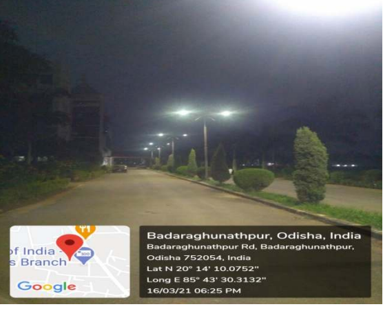
(Street light with LED Facility inside the college)