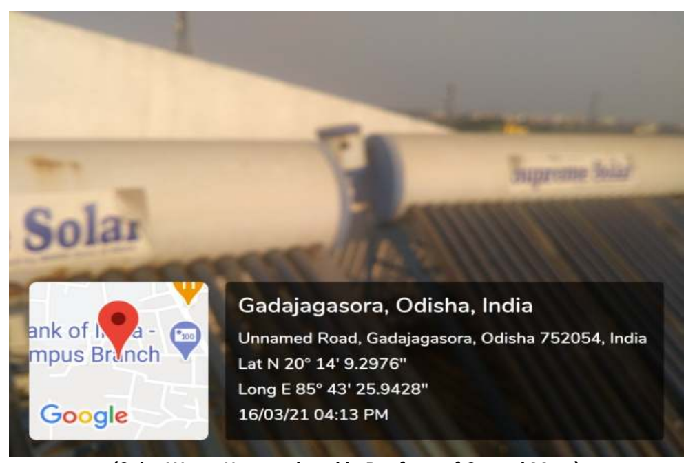
(Solar Water Heater placed in Roof top of Central Mess)