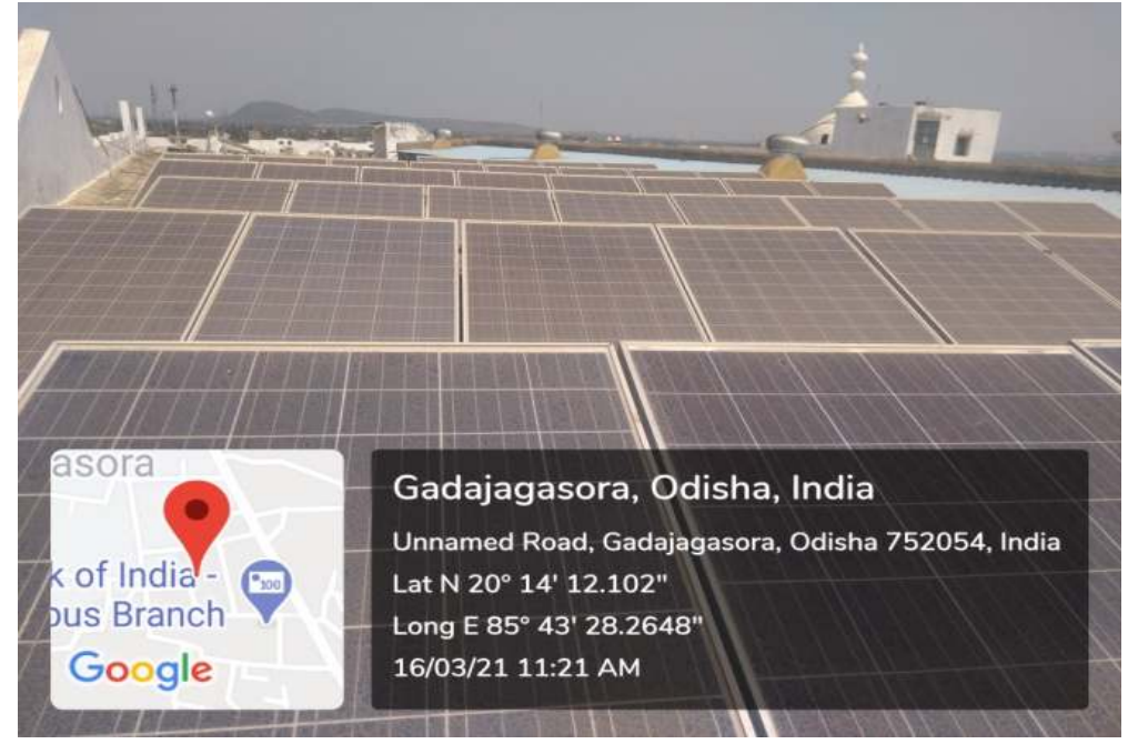
(Solar Panel at the Roof Top North-East Block)