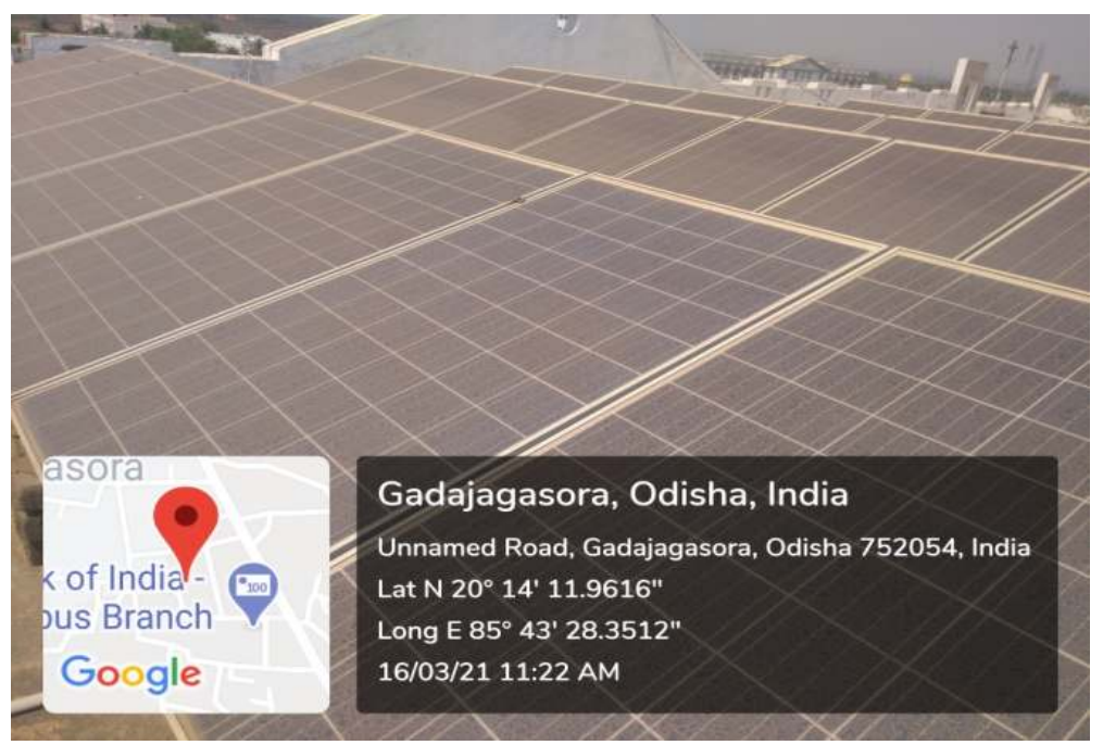
(Solar Panel at the Roof Top South-East Block)