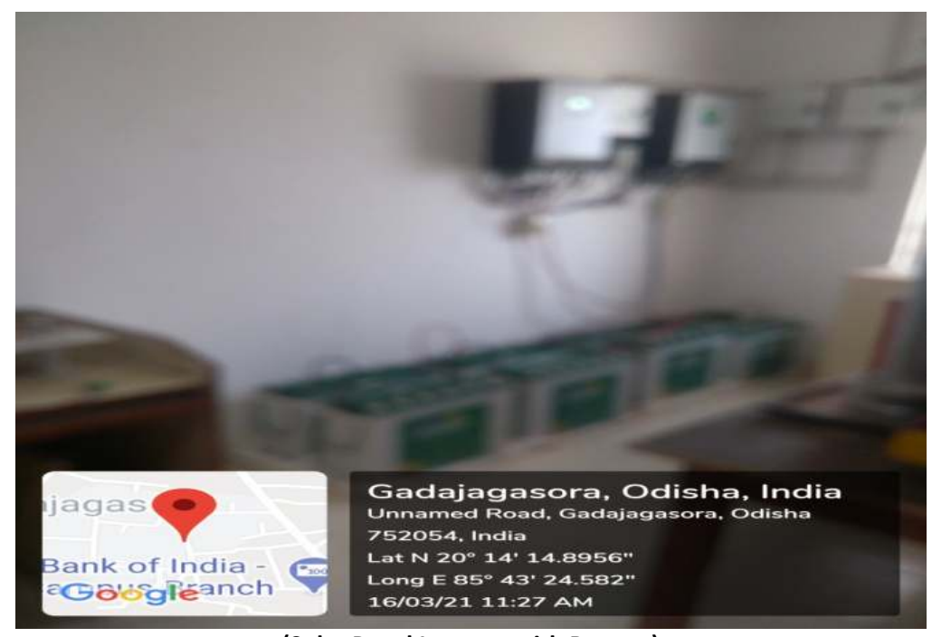
(Solar Panel Inverter with Battery)