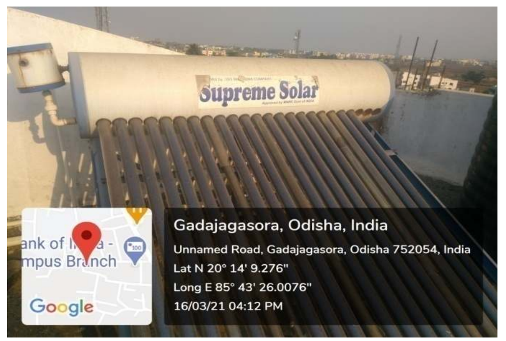
(Solar Water Heater placed in Roof top of Central Mess)