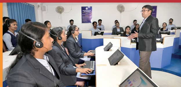
B.Sc B.Sc (Computer Science) B.Sc (Data Science), B.Sc (ITM) B.Sc (Nursing)