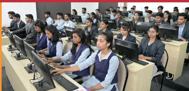
Computer Application MCA BCA