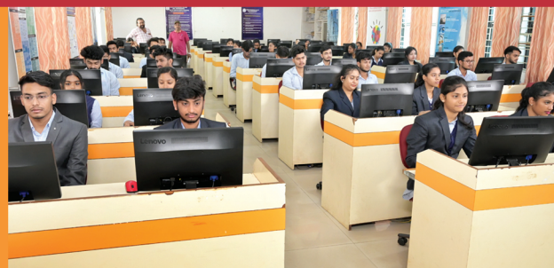
Computer Science & Engineering B.Tech (CSE), B.Tech (CSE-AIML) B.Tech (CSE-Data Science) M.Tech. Data Science