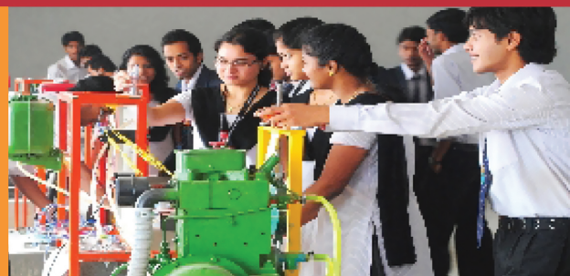
Mechanical Engineering B. Tech (Mech.) Diploma (Mech.) M.Tech. Artificial Intelligence & Robotics