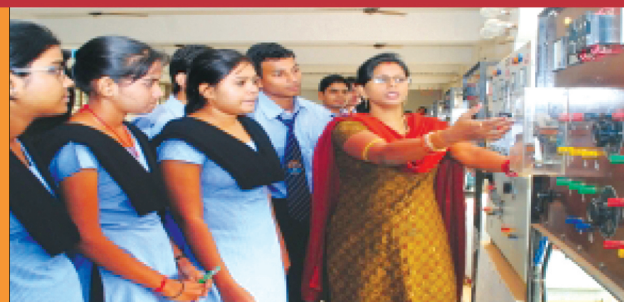
Electrical Engineering Diploma (EE) M.Tech. Electric Vehicle Technology