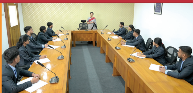
Management Programme MBA BBA