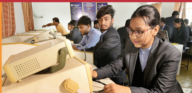
Electronics & Computer Engg. B.Tech (ENCE) M.Tech. Artificial Intelligence & Machine Learning