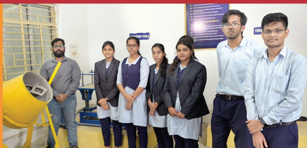
Civil Engineering B.Tech (Civil) Diploma (Civil) M.Tech. Structural Engineering